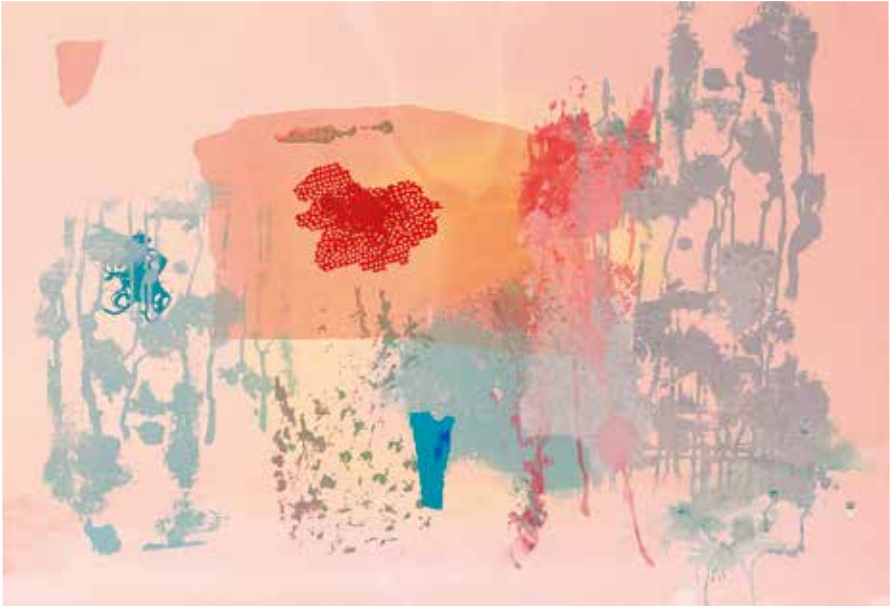
Azahar Painting on paper 103 x 74cm