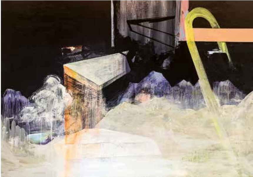
Cracks in a Dream Acrylic on cradled wood panel 89 x 122 x 5cm

Catherine Richardson's paintings and drawings draw inspiration from the striking structures and ancient geology found in remote regions such as the Arctic, Peru and most recently, Eastern Iceland, where she enjoyed a month-long artist residency.