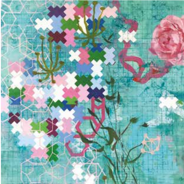
Flutter, 2023 oil on canvas 71 x 71cm

Susanna Lisle's paintings develop from an interplay between organic form, pattern, and geometry. She explores the way that geometry and pattern can serve as metaphors for everyday experience or something more contemplative. From the simplest structures a multitude of complex worlds can emerge, weaving together clarity and ambiguity. These magical and intricate systems are reflected and replicated in nature.